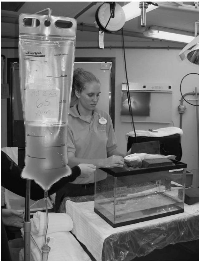
Figure 2 A simple nonrecirculating system using an IV bag and drip set. Gravity-dependent flow rate is controlled by the drip set valve. Used water is collected (in the tank below) but not recycled. This system is suitable for small to medium-sized fish depending on the volume of the reservoir, the drip set tube diameter, and the rate of fluid delivery.

(Harms 1999). The flow is usually normograde to achieve optimal gas and anesthetic exchange. Though retrograde flow is sometimes necessary (e.g., in oral surgery or because of species anatomical variations), it nullifies the normal countercurrent exchange mechanism and may damage the gills.