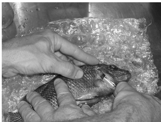
Figure 5 Doppler flow is useful for monitoring heart rate in fish, with probes placed in the opercular slit (for large and medium-sized fish) or directly over the heart (for smaller specimens and small-scaled/scaleless species). This figure demonstrates placement of the probe in the opercular slit of an African cichlid ( Protomelas insignis ).

Although a fish may appear to be ventilating well, bradycardia and an increased resistance to gill capillary flow (as erythrocytes accumulate in the capillary bed and become swollen) may cause hypoxemia (Tyler and Hawkins 1981). Useful variables in detecting hypoxemia include gill color (pallor indicates hypoxemia, hypotension, hypovolemia, or asystole) and fin margin color (pallor indicates hypoxemia, hypotension, or peripheral vasoconstriction) (Harms 2003; Stetter 2001). In large fish, an effective way to monitor respiratory efficiency is periodic blood gas sampling to determine