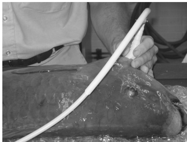
Figure 4 Ultrasonography is useful for monitoring heart rate in fish. In specimens of sufficient size, the probe can be placed in the opercular slit as in this rainbow parrotfish ( Scarus quacamaia ). In smaller specimens or small-scaled/scaleless species, the probe is placed directly over the heart.

In species with thin pliable body walls and proportionally large hearts, heart beats are directly observable (Harms and Bakal 1995; Harms 1999). For most species, however, monitoring of the heart rate requires the use of cardiac ultrasonography, Doppler flow probes, or electrocardiography (ECG) (Harms and Bakal 1995; Harms 1999; Ross 2001). Ultrasonography and Doppler probes are placed either into the opercular slit (for medium to large fish) or directly over the heart (for smaller specimens and small-scaled/scaleless species; Figures 4 and 5). ECG entails lightly clamping electrodes to the surface of the fins (the pectoral and anal fins are a good combination) (Ross 2001); alternatively, subcutaneous placement of needle electrodes minimizes skin trauma, reduces the chance of grounding out the ECG signal by contact with a wet external surface, and improves signal quality