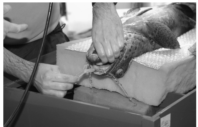
Figure 1 Goliath grouper ( Epinephelus itajara ) positioned on bubble wrap in a foam holder during tricaine methanesulfonate (MS-222) anesthesia. The bifurcated mouthpiece placed in the buccal cavity delivers oxygenated anesthetic water to both sets of gill arches.

During immersion anesthesia, adjustment of the drug concentration in response to anesthetic depth is difficult. One option is to prepare measured volumes of anesthetic-free water and concentrations of anesthetic solution in separate bags or reservoirs for use in either recirculating or nonrecirculating systems. Alternatively, a bulb or other syringe enables rapid delivery of small amounts of anesthetic fluid directly to the gills without disconnecting the fish from the system